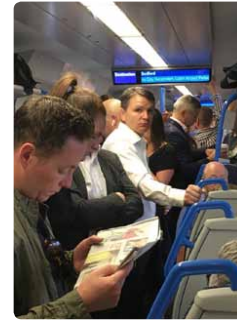
Passengers enjoying their vertical commute on a Thameslink service this summer